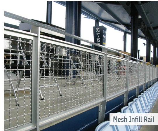
Mesh Infill Rail