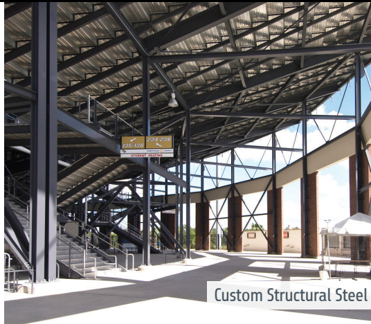
Custom Structural Steel