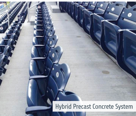
Hybrid Precast Concrete System