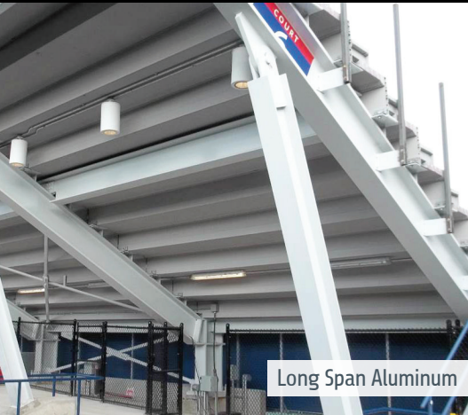
Long Span Aluminum